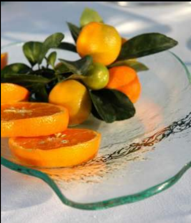
S1-F1-03 -TT23 Bodypart, hip plate.