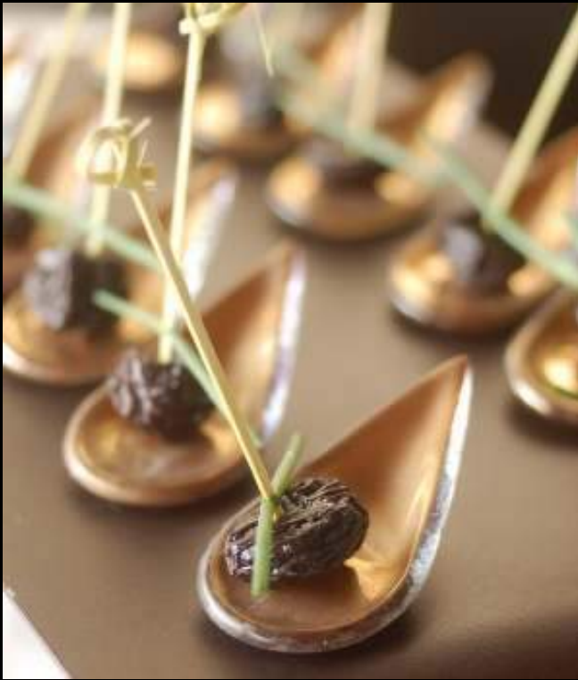
SC-01-12 -SR21 Olive shaped glass spoon. F1-08-12 -C000 Chinese kang table top metal stands, set of two 50*24*10cm and one 75*37*15cm. (comes in ten colors).