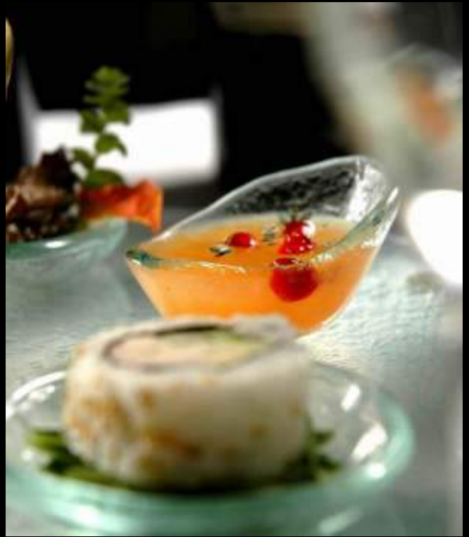
B5-F1-01 -B400 Mini free form bowl.