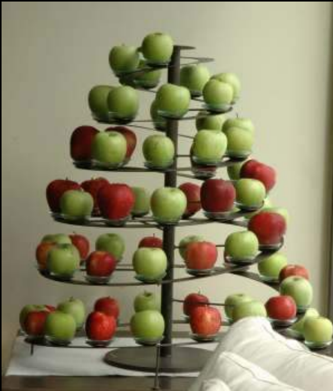
F1-08-07 -C000 Spiral buffet elevation centerpiece for 70 bowls (bowls not included), (metal available in ten colors).