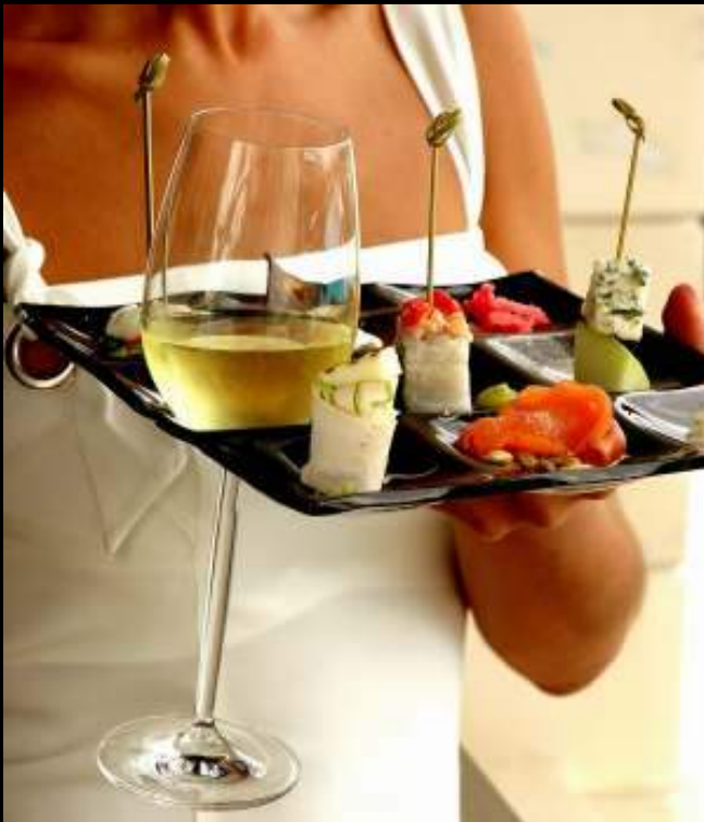
S1-S5-02 -SR43 Cocktail plate with wine glass holder.