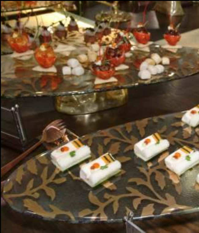
S4-F2-02 -HF21 Flat buffet tray on high bronze/aluminium base. (Cannot be dishwashed over 60°C).