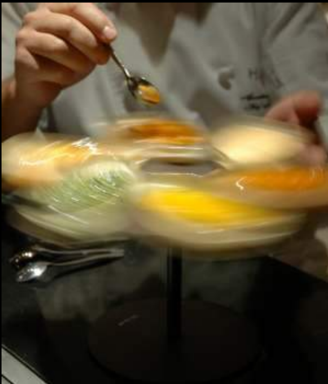
S4-C2-11 -C000 Revolving metal stand with six inlets for condiment bowls (bowls not included).