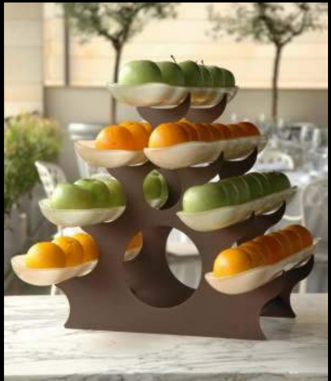
F1-08-05 -C000 Buffet elevation for seven boat bowls F1-F2-08 (metal available in ten colors)-bowls not included.

F1-F2-08 -SR41 Long oval buffet boat bowl.