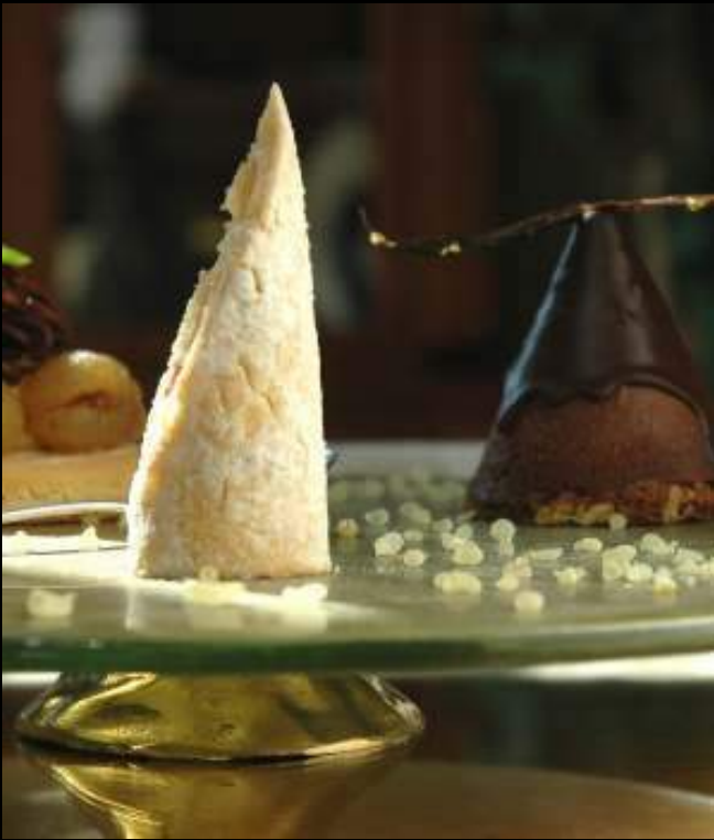
F1-F3-01 -B400 Flat buffet cake tray on bronze/aluminium base (cannot be dishwashed over 60°C).