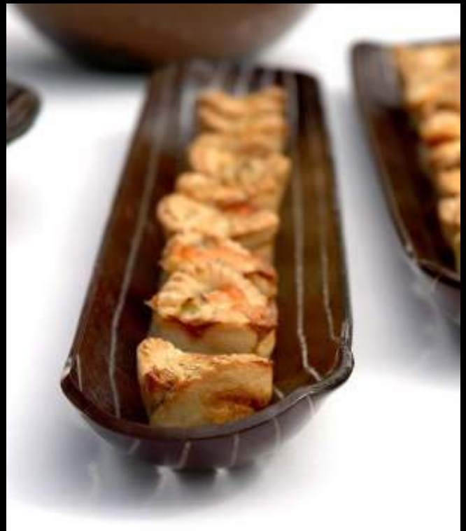
F1-F2-08 -LN28 Long oval buffet boat bowl.