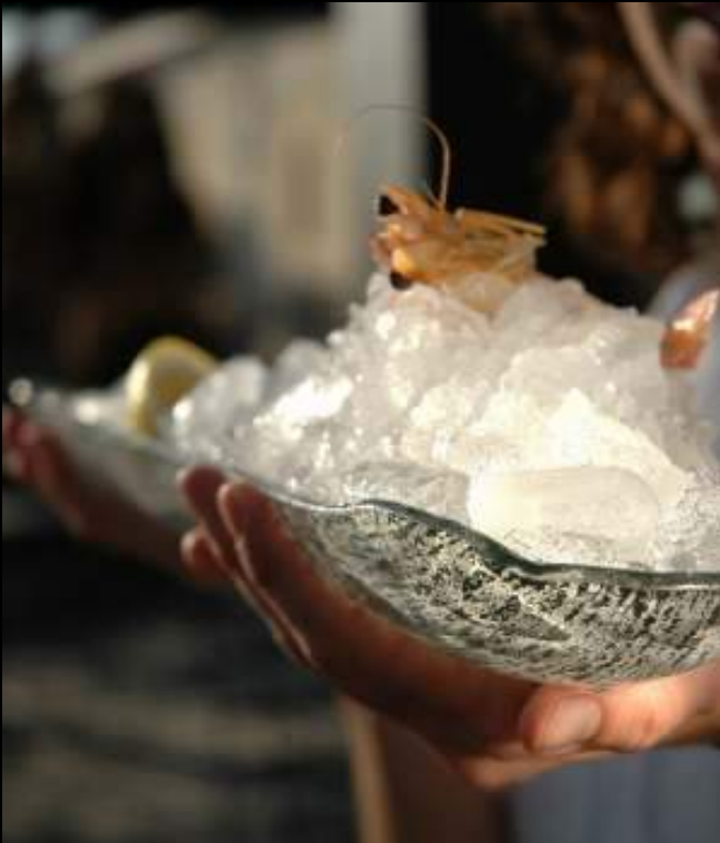
F1-F2-08 -CR23 Long oval buffet boat bowl.