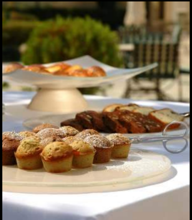
S4-00-29 -SR41 Square platter on round glass base. (Cannot be dishwashed over 60°C).