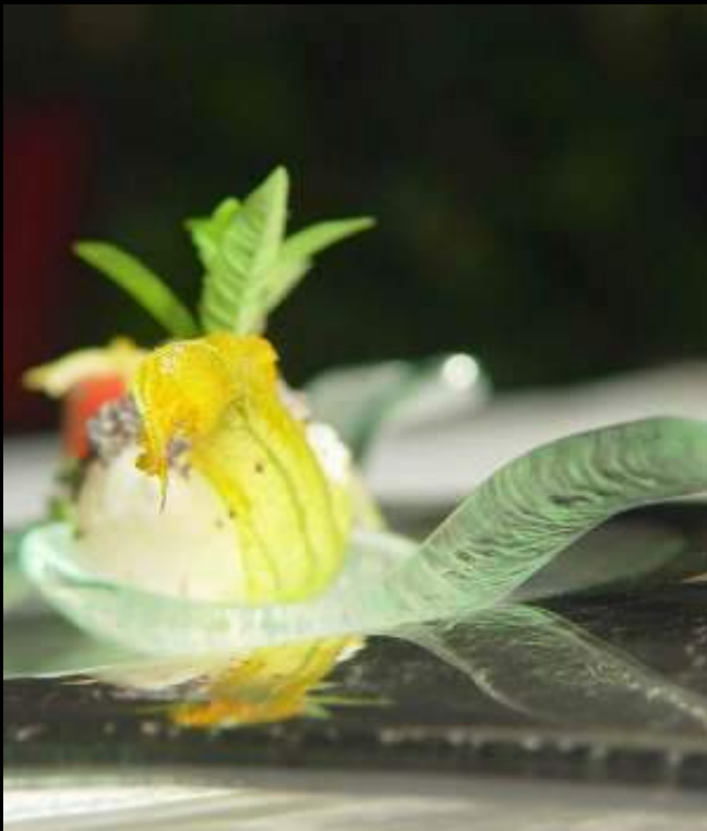
SC-01-00 -X400 Glass spoon. S1-04-00 -HR23 Triangular plate.