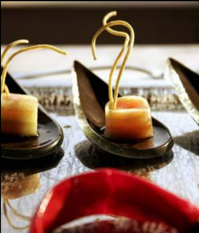
SC-01-12 -SR581 Olive shaped glass spoon. P2-S1-00 -CR23 Square plate with thin conical rim.