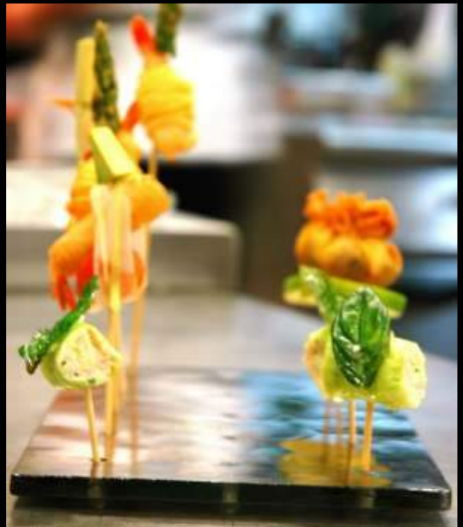
S4-01-29 -SR23 Rectangular pass around plate with 15 lollipop 4mm holes. (Cannot be dishwashed over 60 °C).