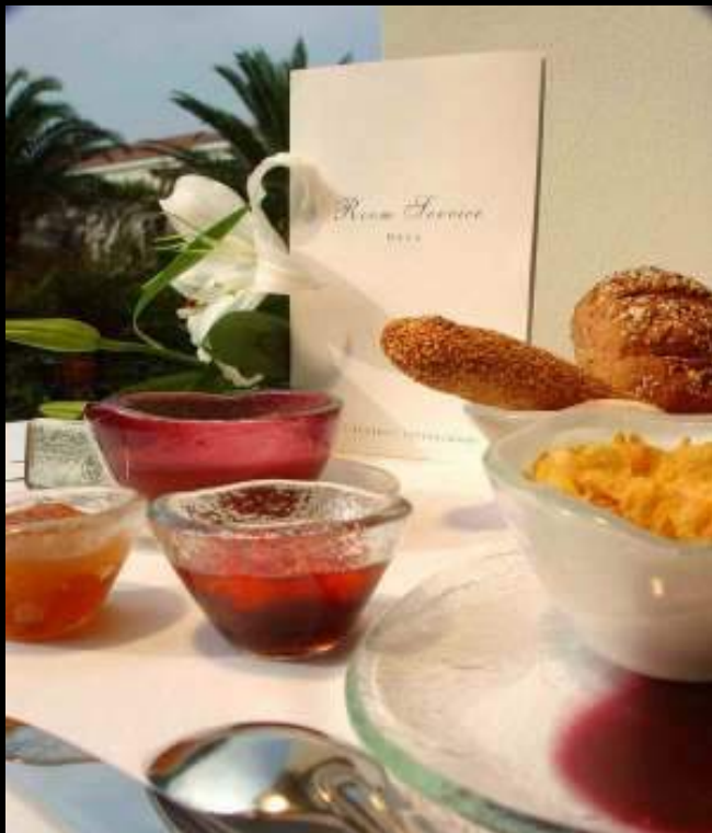
B5-C2-01 -X400 Mini shot glass. B4-02-00 -HR32 Espresso cup. B2-F2-00 -SR42 Deep cereal oval bowl.