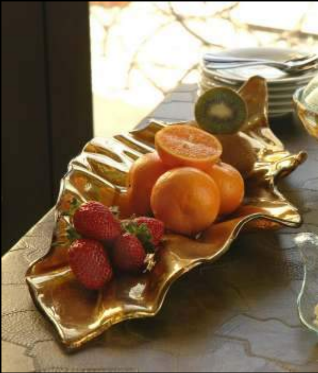
S1-F1-13 -SR21 Leaf shaped plate.