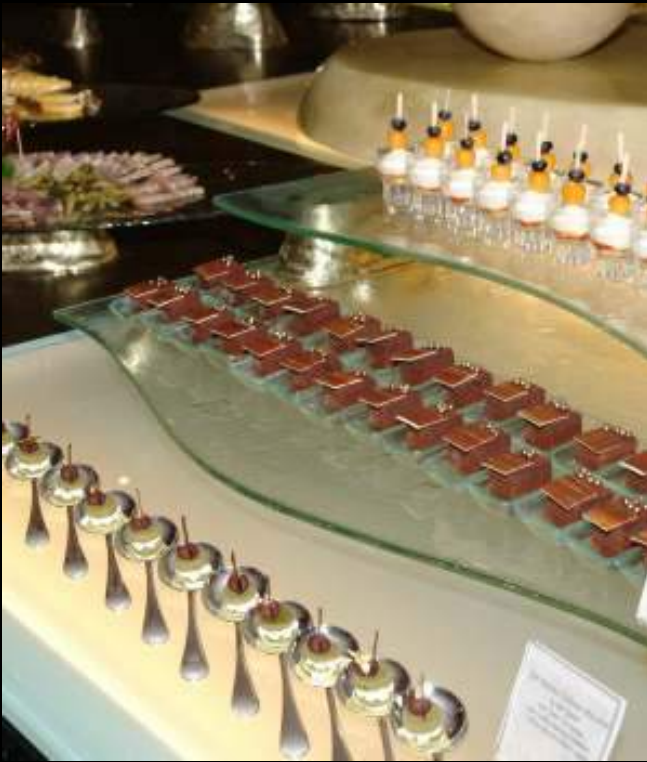
S4-F1-01 -B400 Two level raised buffet counter with bronze/aluminium base. (Cannot be dishwashed over 60°C).