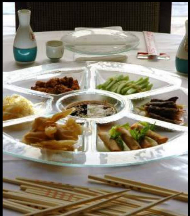
S3-C1-02 -X400 Chinese big appetizer plate. P2-C1-01 -X400 Round plate with thin conical rim.