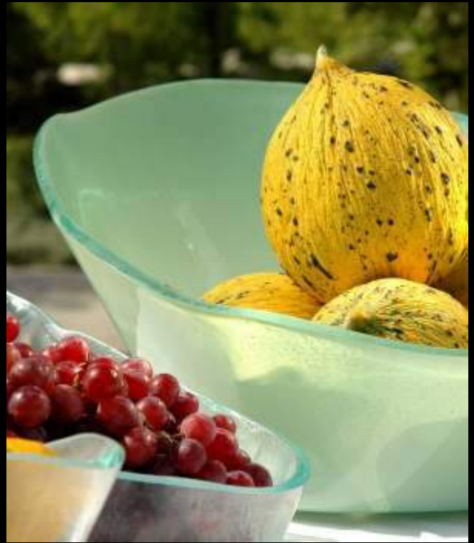
F1-C2-11 -SR56 Extra large round inclined bowl (front height 40cm, back 11cm, irregular height approx. +- 2cm).