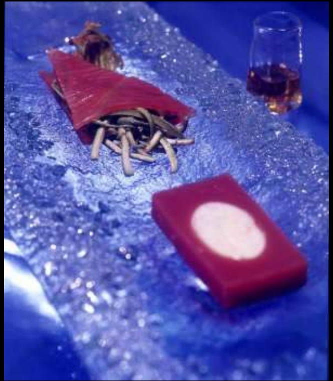
F1-S2-03 -CH40 Large rectangular buffet tray.