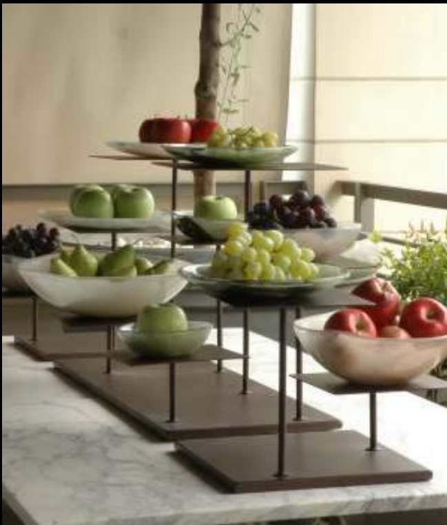
F1-08-02 -C000 Three-piece buffet elevation setup. Dimensions: a) Center piece, 80x30cm with two elevations of 20x30cm and four of 20x20cm. b) Side pieces, 30x30cm with two elevations 20x20cm. Elevation heights: 40cm, 25cm and 10cm. Metal comes in ten colors. (Bowls and plates not included)