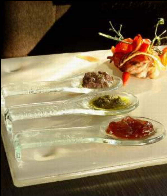
SC-01-05 -X400 Canape glass spoon. S1-F3-00 -SR41 Raised square flat tile.