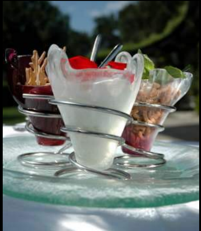
S4-00-08 -CL42 Ice cream bowl on a metal spiral base (irregular height approx. +-2cm) (available in ten colors). S4-00-08 -SR32 Ice cream bowl on a metal spiral base (irregular height approx. +-2cm) (available in ten colors). S4-00-08 -MF32 Ice cream bowl on a metal spiral base (irregular height approx. +-2cm) (available in ten colors).