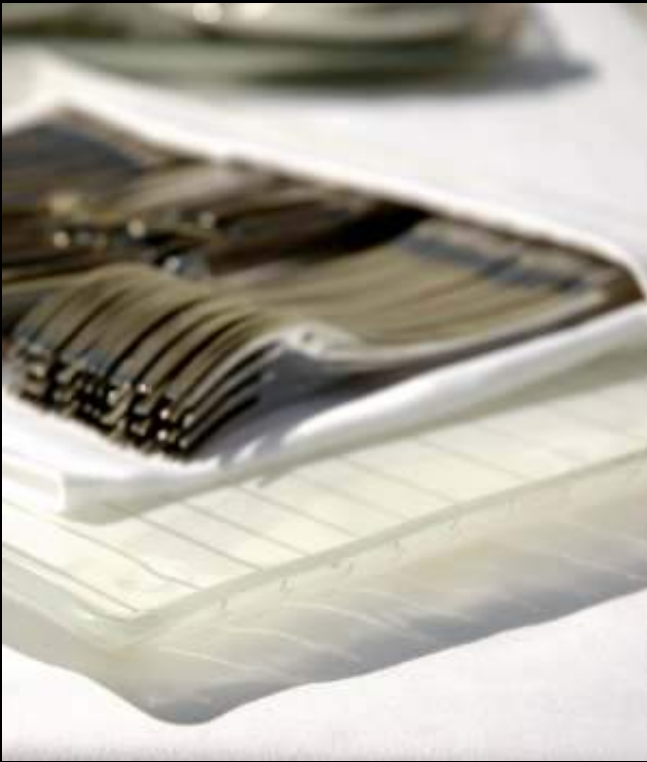
F1-S5-00 -LN42 Rectangular plate with softly raised rim.