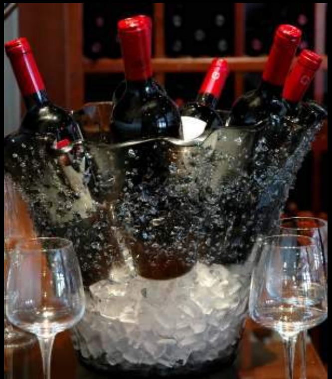
F1-C2-13 -CH46 Container bottle display with drainage socket (irregular height approx. +- 2cm).