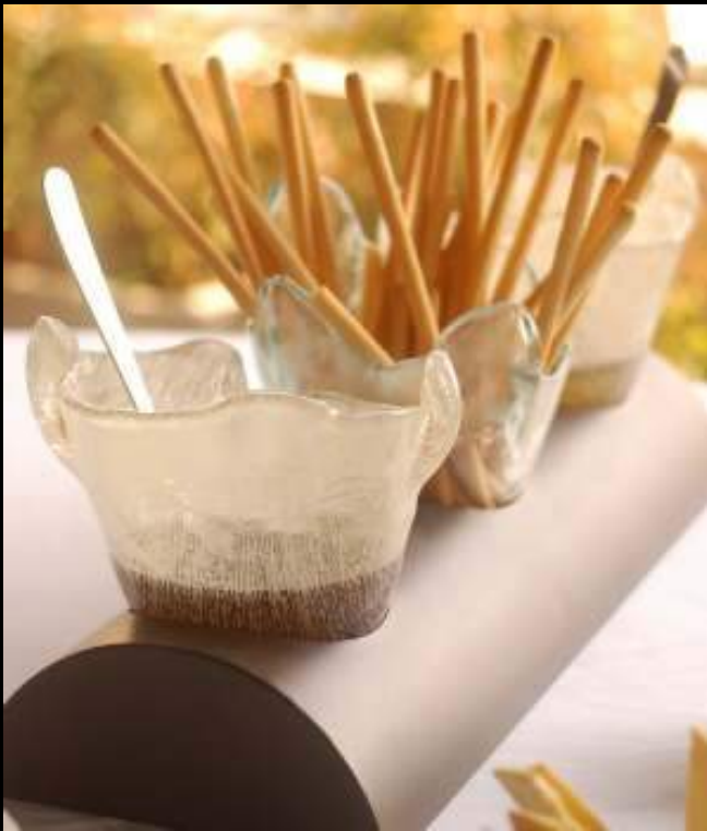
F1-08-16 -C000 Cylindrical metal (wr) base for buffet dressing bowls F1-C2-22 not included. F1-C2-22 -CR411 Deep buffet dressing bowl with irregular finish.