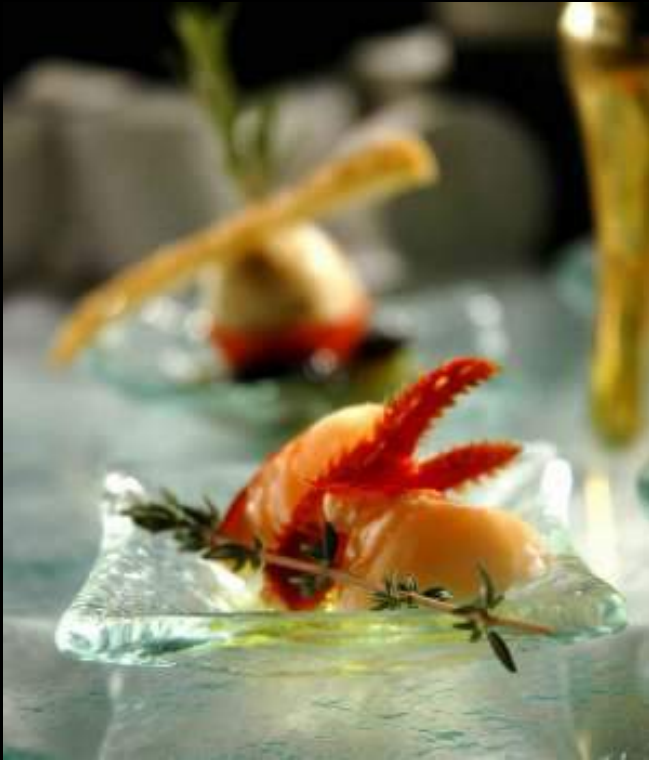
P5-S4-02 -B400 Small plate with conical rim.