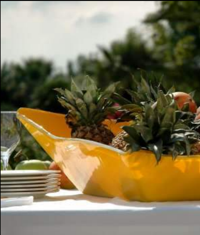
F1-S4-05 -SR27 Large rectangular inclined buffet bowl with conical rim (front height 8cm, front width 30cm, back height 17cm, irregular height approx. +- 2cm).