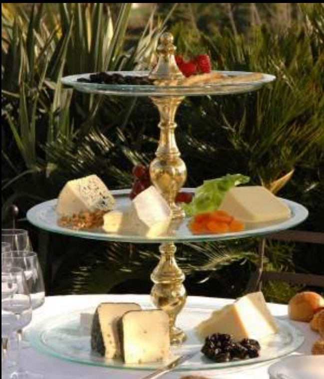
S4-C1-03 -X400 Huge three tier baroque bronze/aluminium buffet platter.