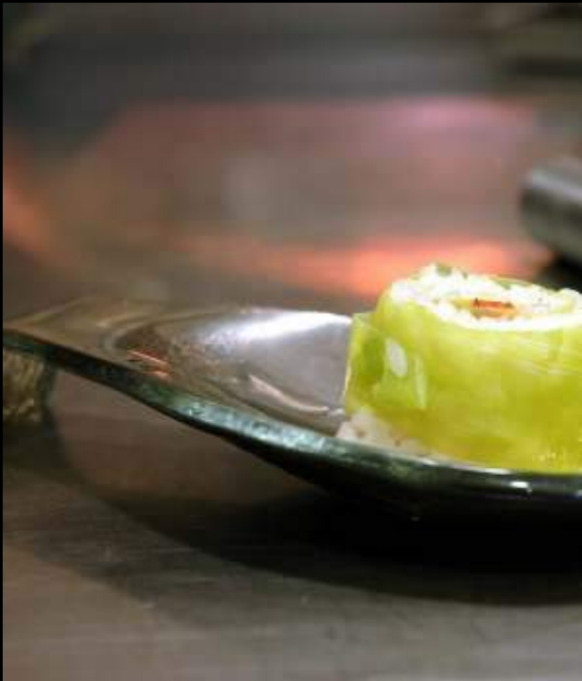
S2-F2-14 -SR23 Oval shaped plate.