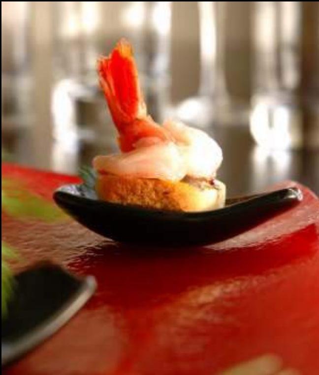
B5-F2-01 -SR43 Small oval bowl shaped like a spoon. S1-F1-09 -SR38 Bodypart, ribs long plate.