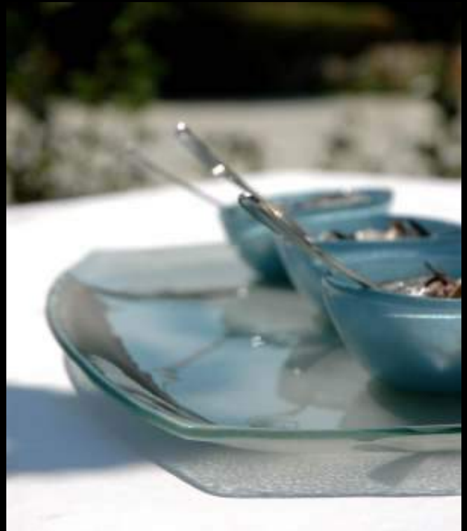
F1-C4-00 -SR47 Rectangular tray with rounded edges. B1-C2-06 -SR11 Large cup.