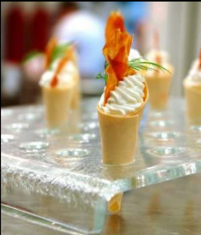
F1-02-18 -X400 Food cone stand (front height 3cm, back height 5,5cm) with 49 holes (diam. 1,5cm) for small food-cones. S1-S5-05 -CS42 Rectangular hamburger plate with two holes (4cm) on the curved side for food cones (french fries or onion rings). S3-02-20 -CL42 Meeting room tray on attached glass supports, with two round inlets for glass and bottle (diam. 7cm), one square inlet for amenities (5*5cm), and a glass cone for pencils. S4-01-00 -X400 Tall standing bridge with two holes for food cones. S4-01-01 -AS42 Short standing bridge with two holes for food cones.