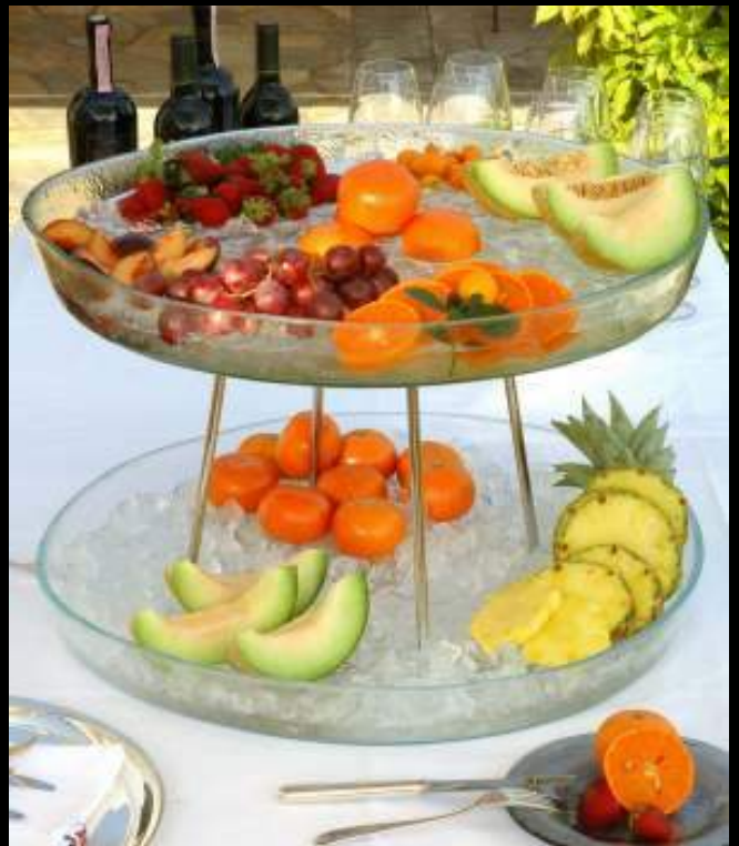
F1-C2-14 -X400 Two tier crustacian ice presentation platters (height 6cm) on inox rack (irregular bowl height +-1cm).