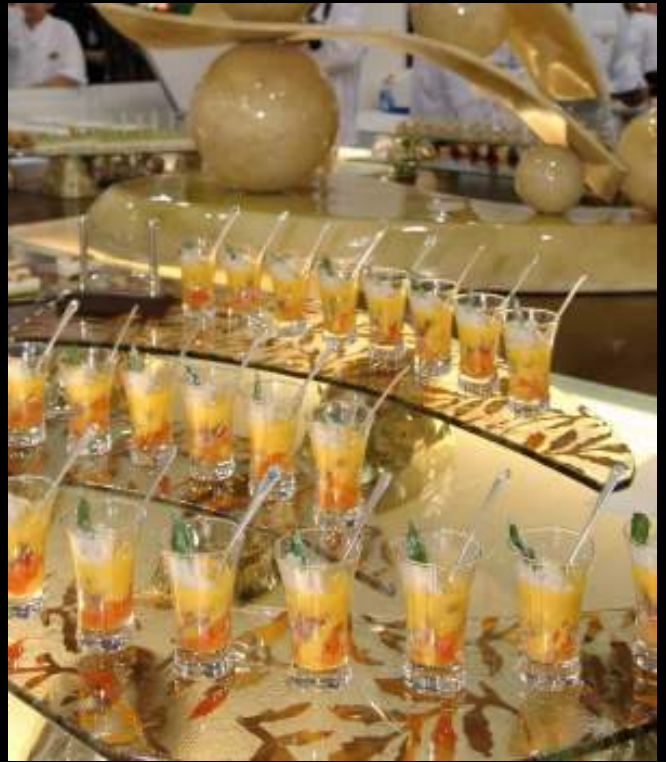
S4-F1-02 -HF21 Multiple level buffet display with bronze/aluminium base. (Cannot be dishwashed over 60°C).