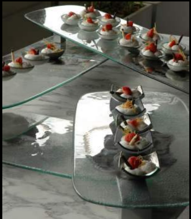
F1-08-13 -TK23 Metal rectangular elevations in two sizes for shelves arrangement. Set/4 glass bridges and metal sizes 6*6*12cm (five included) and 3*3*3cm (four included) (comes in ten colors).

P3-C3-01 -HR23 Round plate with raised rim.