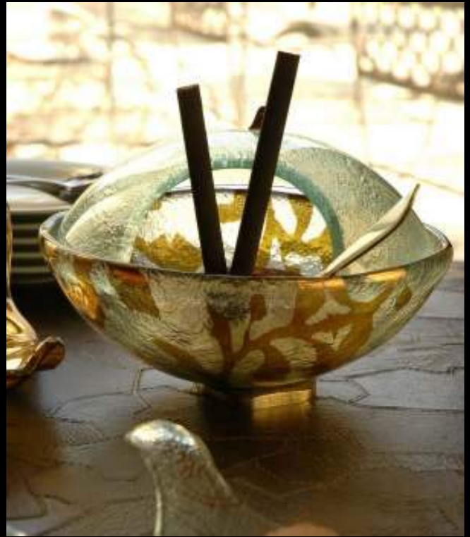
S1-05-16 -X400 Round cloche open from one side for buffet cereal bowl. (Cannot be dishwashed over 60°C). S4-00-35 -HF21 Round bowl on flat bronze/aluminium base. (Cannot be dishwashed over 60°C). SC-01-04 -LF21 Chinese glass soup spoon.