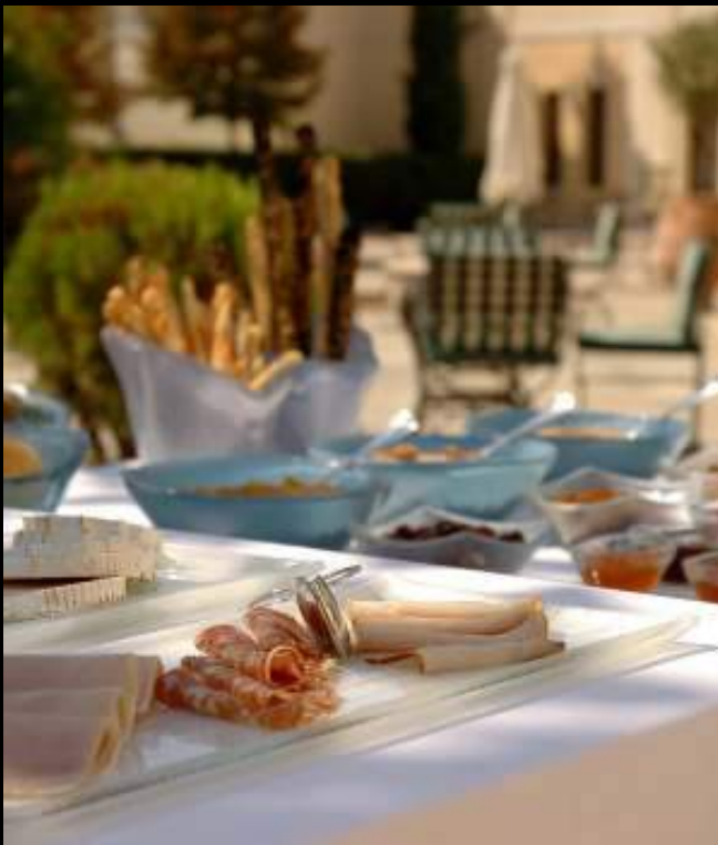
F1-S5-00 -LN42 Rectangular plate with softly raised rim. F1-C2-03 -SR11 Deep buffet bowl. F1-02-09 -SR13 Round vase for bread sticks (irregular height approx. +- 2cm).