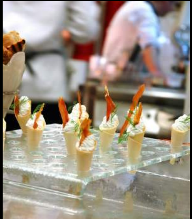
F1-02-18 -X400 Food cone stand (front height 3cm, back height 5,5cm) with 49 holes (diam. 1,5cm) for small food-cones. S4-00-08 -SR41 Ice cream bowl on a metal spiral base (irregular height approx. +-2cm) (available in ten colors).