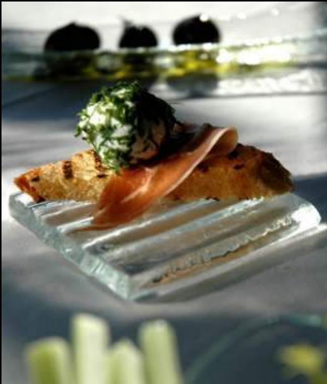
P5-S3-02 -RX40 Small plate with a light open curvy form. S2-F2-10 -X400 Small boat plate.