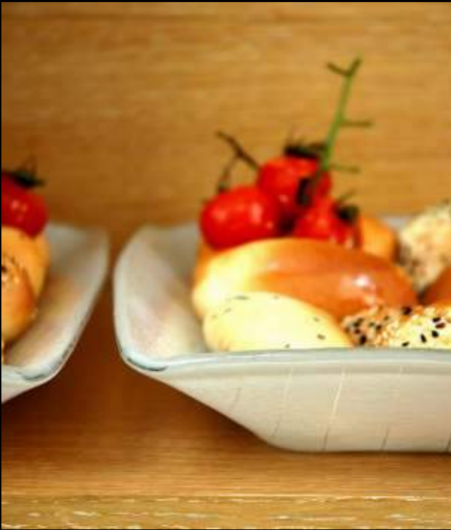
B2-S4-03 -LN41 Rectangular deep bowl with large conical rim.