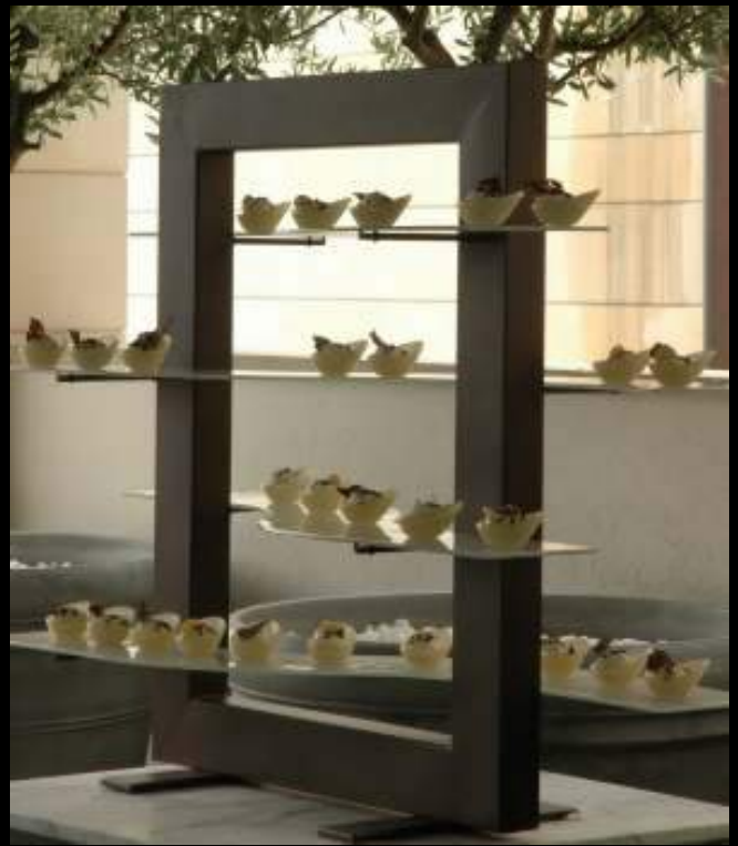
F1-08-10 -SR41 Extra huge frame elevation centerpiece (metal comes in ten colors). B5-F1-01 -SR411 Mini free form bowl.