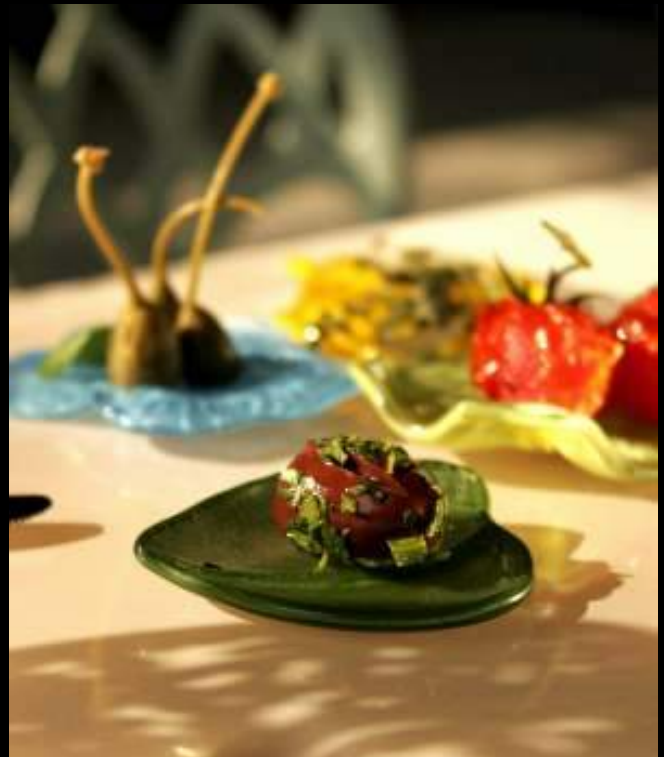
P5-F1-08 -SR58 Small leaf shaped plate. P5-F1-07 -SR11 Small flower shaped plate. P5-F1-07 -SR272 Small flower shaped plate.