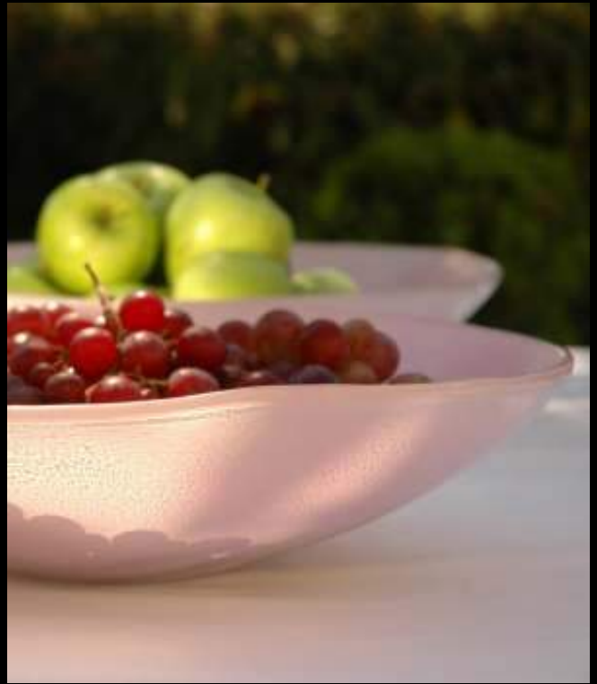
F1-C2-01 -SR333 Large buffet bowl.