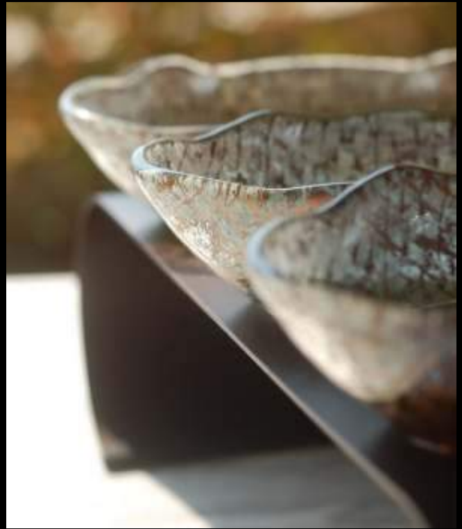
S4-01-35 -C000 Chinese kang metal (wr) dressing bowl stand (comes in ten colors), bowls B2-F2-03 are not included. B2-F2-03 -LC026 Oval dressing bowl.