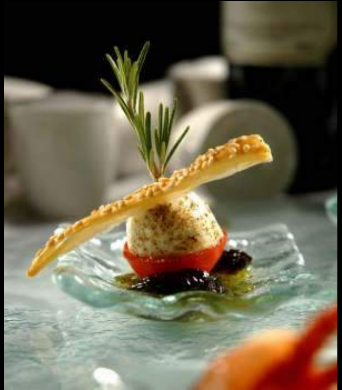
P5-F1-06 -B400 Small square plate with wavy surface.