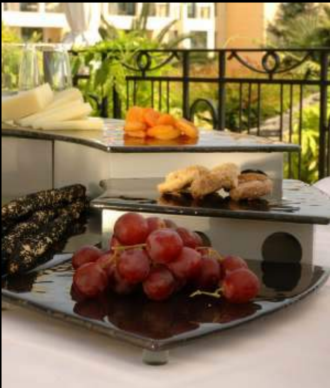
S4-F1-07 -SR43 Multilevel amphitheatrical buffet counter. (Metal available in ten colors).