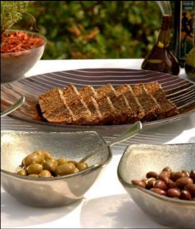
F1-C2-05 -LN28 Large buffet platter with raised center. B2-C4-00 -SR23 Bowl with four edges.