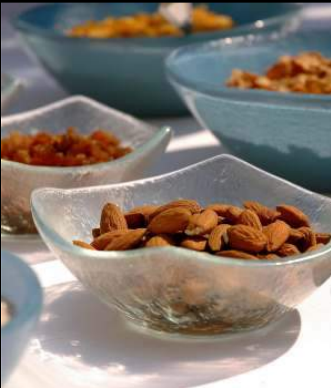
B1-C4-00 -X400 Bowl with four edges. B2-C2-02 -SR11 Buffet/salad bowl.