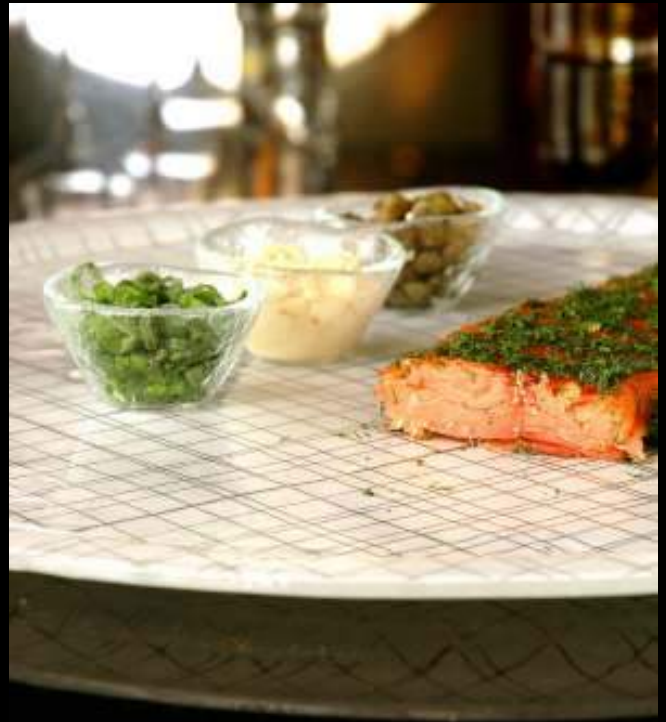
F1-C1-04 -SL42 Round tray with horizontal rim.