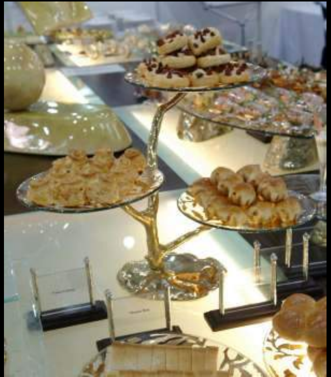
S4-F1-03 -HF21 Three tier stand bronze/aluminium base. (Cannot be dishwashed over 60°C).