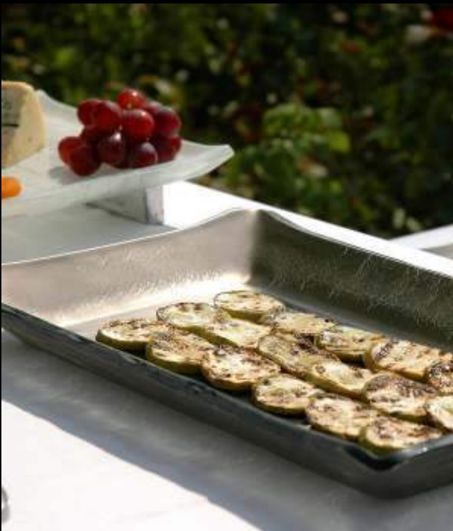
F1-S4-02 -SR23 Rectangular deep buffet platter with large conical rim.