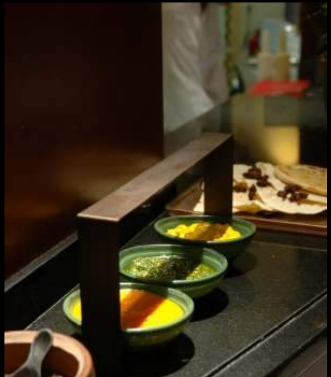
SC-08-67 -C000 Rectangular metal stand with inlets for three bowls (comes in ten colors). Bowls (B1-F2-02) not included.