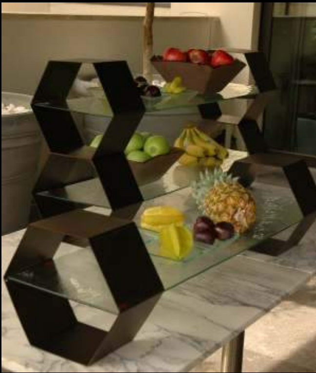
F1-08-15 -X400 Honeycomb elevation setup in two sizes for selves arrangement and glass bridges 100*29cm (metal comes in ten colors). B2-S4-05 -HR028 Rectangular deep salad bowl with large conical rim. B1-S4-02 -X400 Square yoghurt/rice bowl with conical rim.