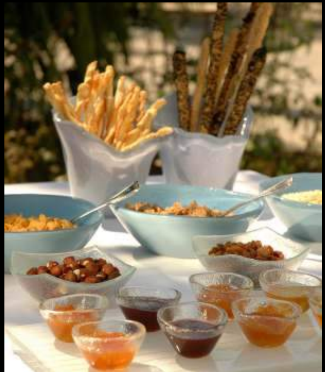
B5-C2-01 -X400 Mini shot glass. B2-C4-00 -X400 Bowl with four edges. F1-C2-03 -SR11 Deep buffet bowl. F1-02-09 -SR13 Round vase for bread sticks (irregular height approx. +- 2cm).