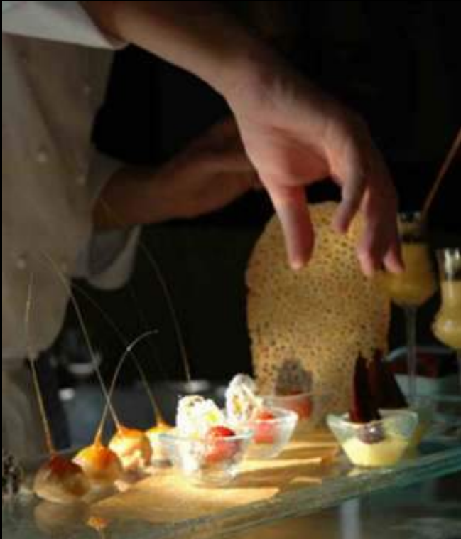
B5-C2-01 -X400 Mini shot glass. F1-S1-00 -B400 Elevated buffet tray on bronze/aluminium feet (cannot be dishwashed over 60°C).