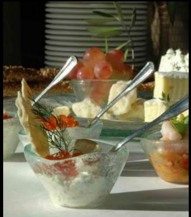
B5-C2-01 -X400 Mini shot glass.