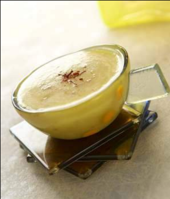
B4-01-00 -MD43 Coffee cup (cannot be dishwashed over 60 °C). SC-03-00 -DL11 Square coaster.