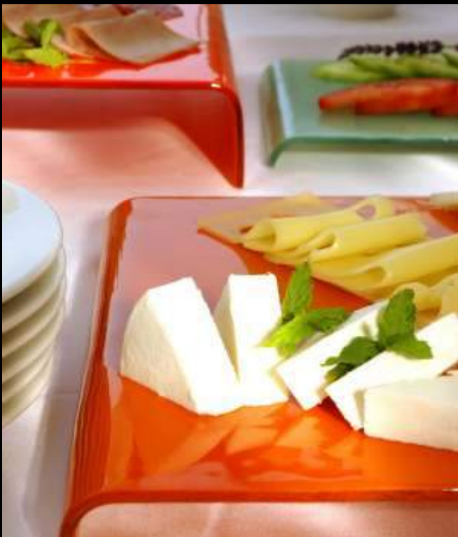
S1-S2-09 -SR275 Bridge flat plate. S1-S2-10 -SR25 High bridge plate. S1-S2-07 -SR056 Rectangular bridge flat plate.