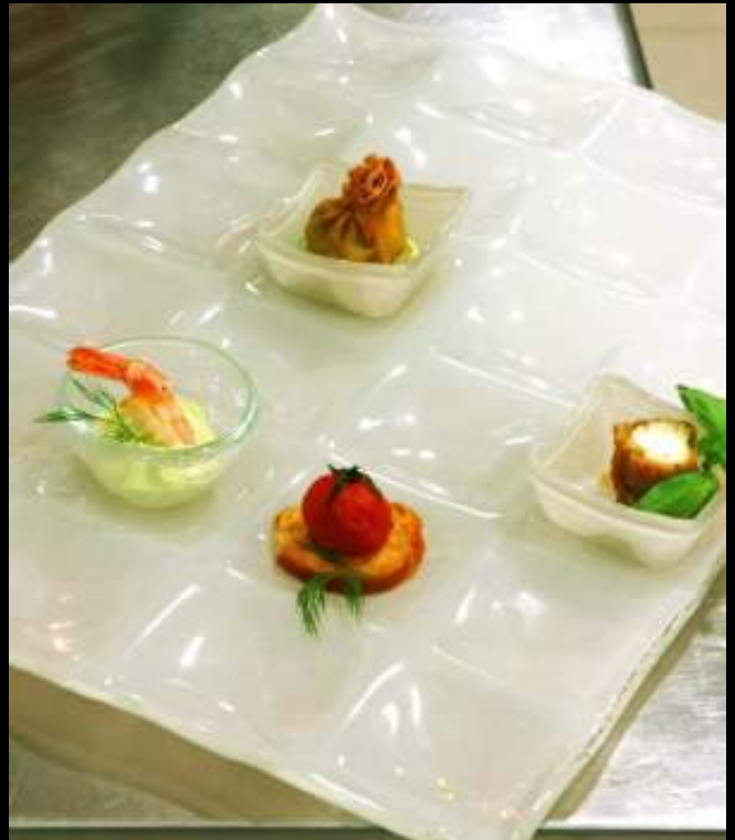
F1-S5-02 -SR41 Pass-around tray with 24 inlets. B5-S4-00 -SR41 Small square bowl. B5-C2-01 -X400 Mini shot glass.