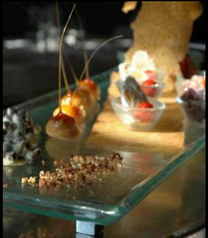
F1-S1-00 -B400 Elevated buffet tray on bronze/aluminium feet (cannot be dishwashed over 60°C). B5-C2-01 -X400 Mini shot glass.