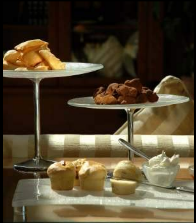
S4-00-22 -CL42 Round platter on bronze/aluminium pedestal. (Cannot be dishwashed over 60°C). S4-00-23 -CL42 Round small platter on bronze/aluminium pedestal. (Cannot be dishwashed over 60°C). F1-F3-09 -DG042 Free form buffet tray on attached glass supports. B5-C2-01 -X400 Mini shot glass.