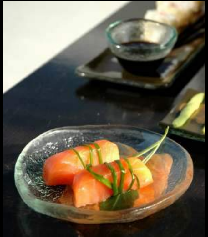
P5-F1-01 -TK04 Small round free form plate.