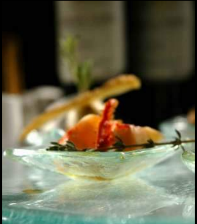
P5-S4-02 -B400 Small plate with conical rim.