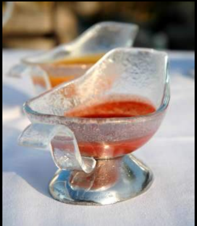
S4-F1-10 -X400 Big sauce bowl on bronze/aluminium base and glass handle. (Cannot be dishwashed over 60°C). S4-F1-09 -X400 Small sauce bowl on bronze/aluminium base and glass handle. (Cannot be dishwashed over 60°C).