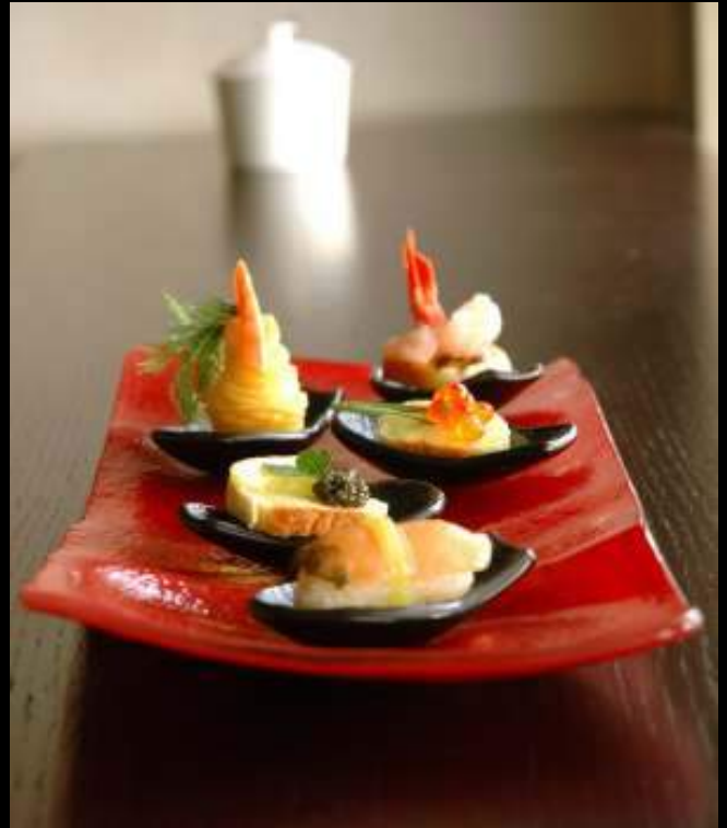
S1-F1-09 -SR38 Bodypart, ribs long plate. B5-F2-01 -SR43 Small oval bowl shaped like a spoon.