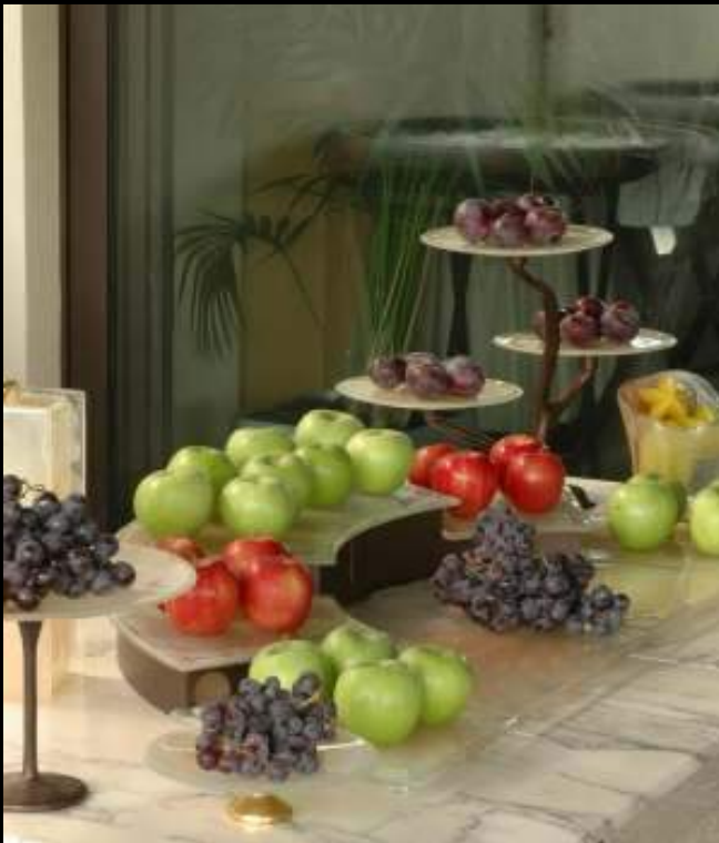
S4-F1-07 -MCL41 Multilevel amphitheatrical buffet counter.(Metal available in ten colors). S4-F1-03 -MCL41 Three tier stand bronze/aluminum base. (Cannot be dishwashed over 60°C). S4-00-22 -MCL41 Round platter on bronze/aluminium pedestal. (Cannot be dishwashed over 60°C). F1-02-09 -MCL41 Round vase for bread sticks (irregular height approx. +- 2cm). F1-02-13 -MCL41 Candy jar with lid (cannot be dishwashed over 60°C).