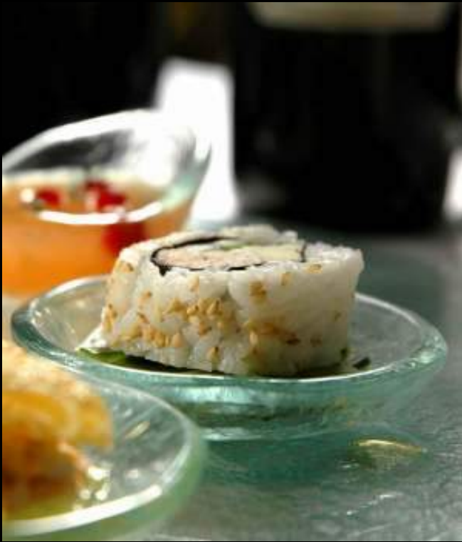
P5-F1-02 -B400 Small round free form plate.