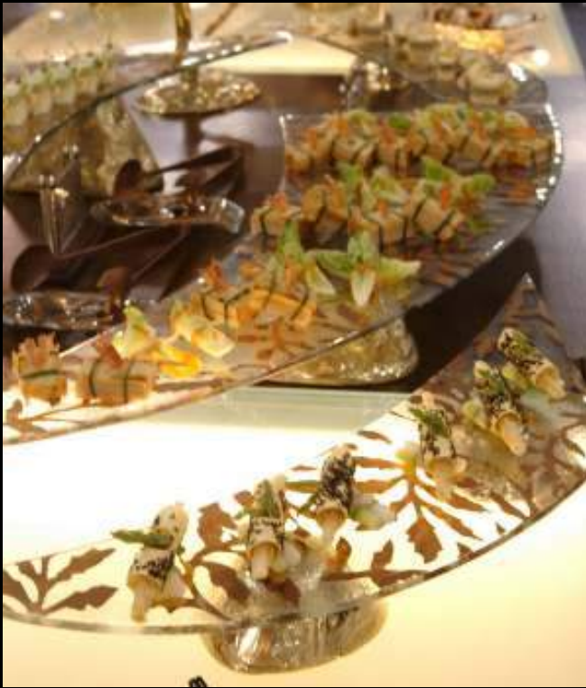
S4-F1-02 -HF21 Multiple level buffet display with bronze/aluminium base. (Cannot be dishwashed over 60°C).