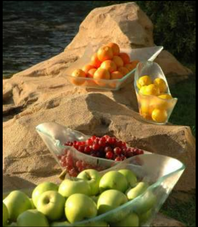
F1-S4-04 -X400 Extra large rectangular inclined buffet bowl with conical rim (front height 11cm, back height 21cm, front width 42cm, irregular height approx. +/- 2cm). F1-F2-18 -X400 Oval inclined bowl (front height 12cm, back 26cm, approximately +/- 1-2cm). F1-F2-17 -X400 Extra large oval inclined bowl (front height 9cm, back 18cm irregular height approx. +/- 2cm).