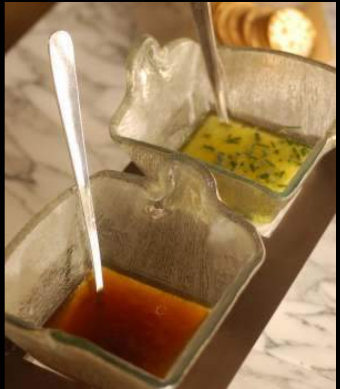
F1-08-18 -C000 Dressing bowl stand for conical dressing bowls F1-S4-07. Bowls not included. Metal (wr) comes in ten colors. F1-S4-07 -CR41 Deep dressing bowl with big conical rim (irregular height apptox. +-2cm).