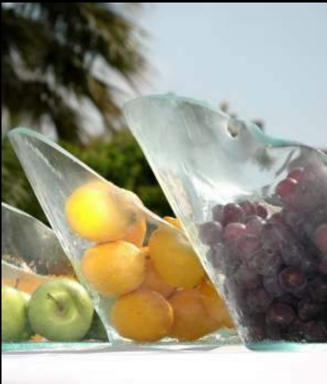
F1-F2-14 -X400 Oval large inclined bowl (front height 8cm, back 23cm irregular height approx. +- 2cm). F1-F2-18 -X400 Oval inclined bowl (front height 12cm, back 26cm, approximately +/- 1-2cm).