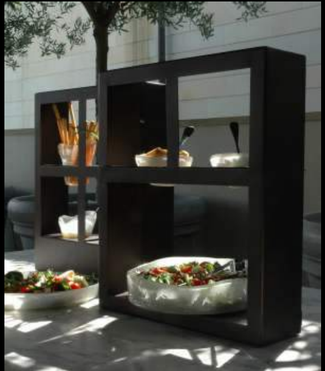
F1-08-19 -C000 "Window display" buffet salad and dressing bowl set up (metal available in ten colors).