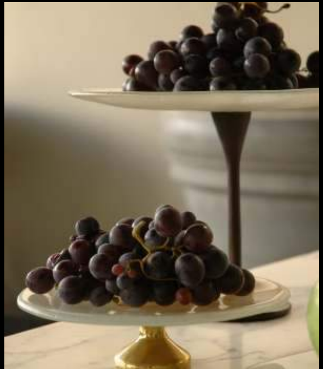
S4-00-22 -MCL41 Round platter on bronze/aluminium pedestal. (Cannot be dishwashed over 60°C). S4-00-20 -MCL41 Flat plate on bronze/aluminium base. (Cannot be dishwashed over 60°C).