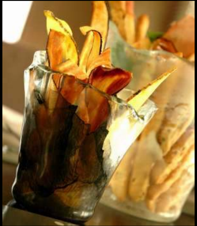
SC-08-09 -CL43 Round small vase for bread sticks, (irregular height approx. +- 2,5cm). F1-02-09 -CL42 Round vase for bread sticks (irregular height approx. +- 2cm).