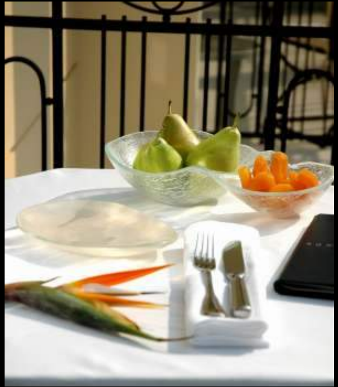
S3-F1-00 -CR41 Deep double dipping plate. P3-F2-02 -SR41 Large oval plate with raised rim.