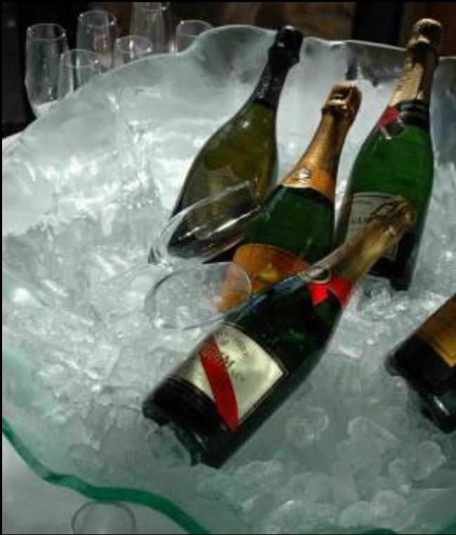
F1-C2-02 -B400 Extra large round bowl (irregular finish +-2cm).