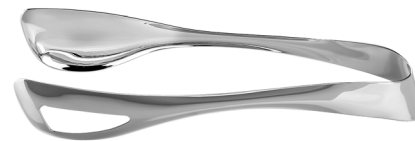
SLICED MEAT & CHEESE TONGS 170MM - GRM880074