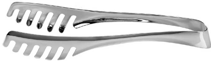
SPAGHETTI & NOODLE TONGS 260MM - GRM880082