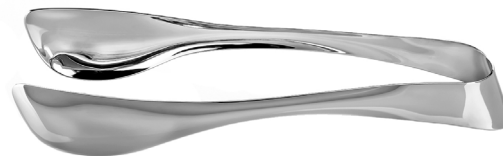
SALAD AND VEGETABLE TONGS 210MM - GRM 880078