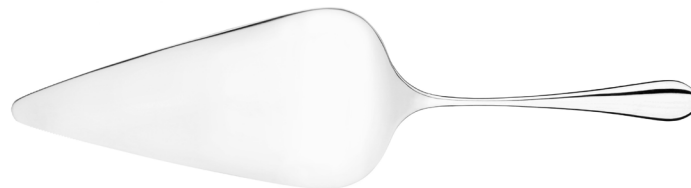
PIE SERVER 248MM - MUM880016