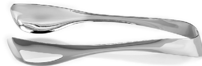
WOK AND CHAFING DISH TONGS 260MM - GRM880081