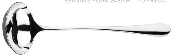
SOUP LADLE 300MM - MUM880030